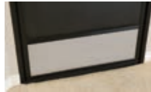
Stainless Kick Plate