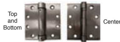
Heavy Duty Hinges